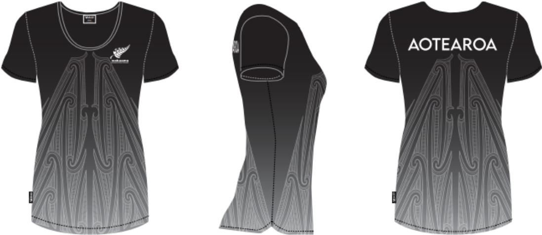
Elite Womens Racing Tshirt