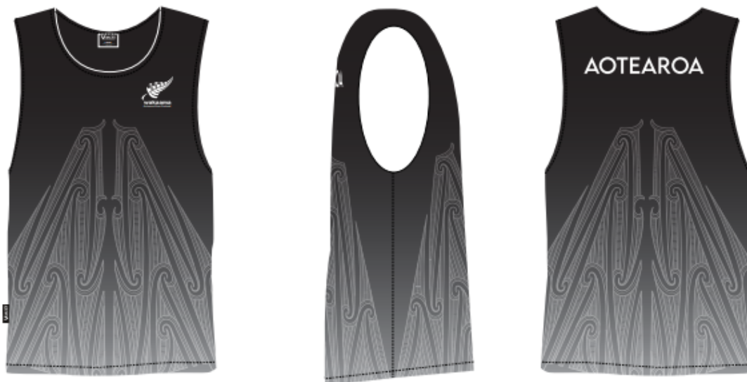
Elite Unisex Racing Singlet