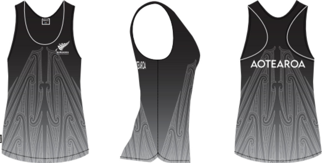
Elite Womens Racing Singlet