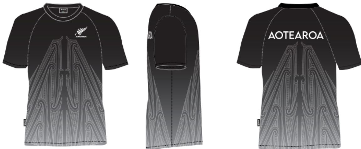
Elite Unisex Racing Tshirt